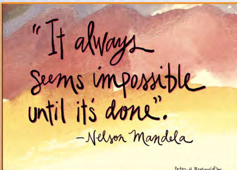
Peter H. Reynolds