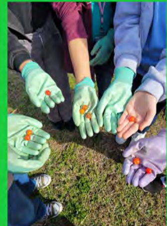
STEM Environmental Students enjoy their bounty!

★ FELLOWSHIP OF CHRISTIAN ATHLETES CLUB ★